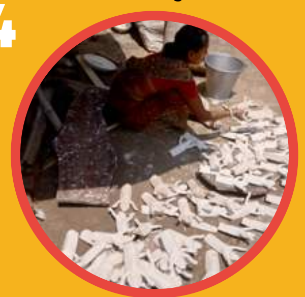
White Clay Coating & Drying